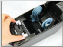
Transmissive sensor (Gap, Media sensor)