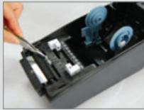
Reflective sensor (Black Mark Sensor)